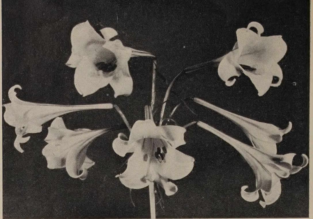
FORMOSANUM White, emerald-green throat (See Page 6)